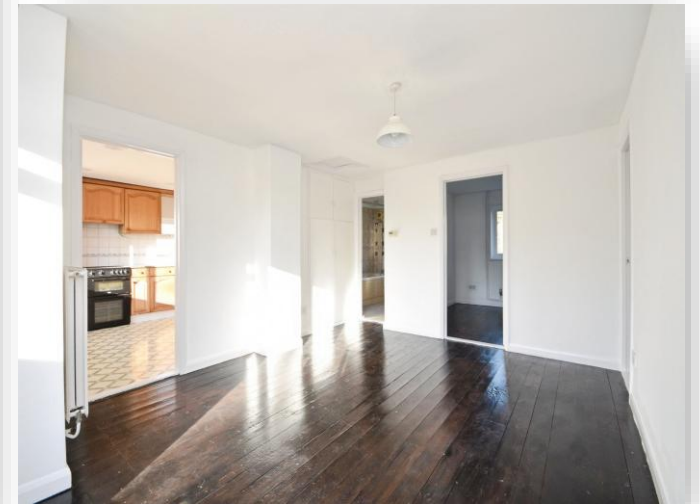
The Chase (whole Plot), Pretoria Road, Halstead, CO9 2EG