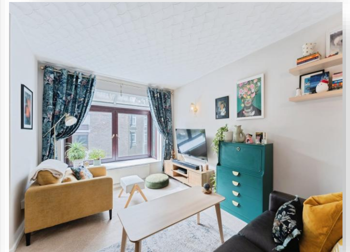
Yewdale Park, Prenton, CH43 5XD