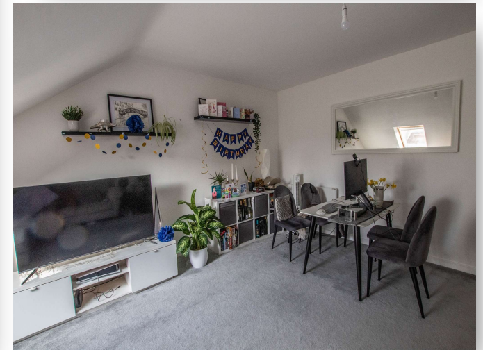
Cootes Court Cootes Lane, Fen Drayton, Cambridge, CB24 4YP