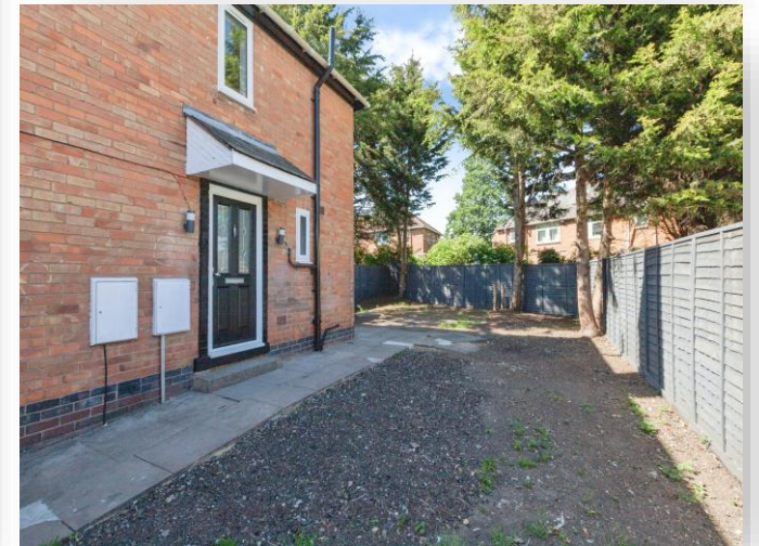
Stephenson Drive, Leicester LE3 9AD