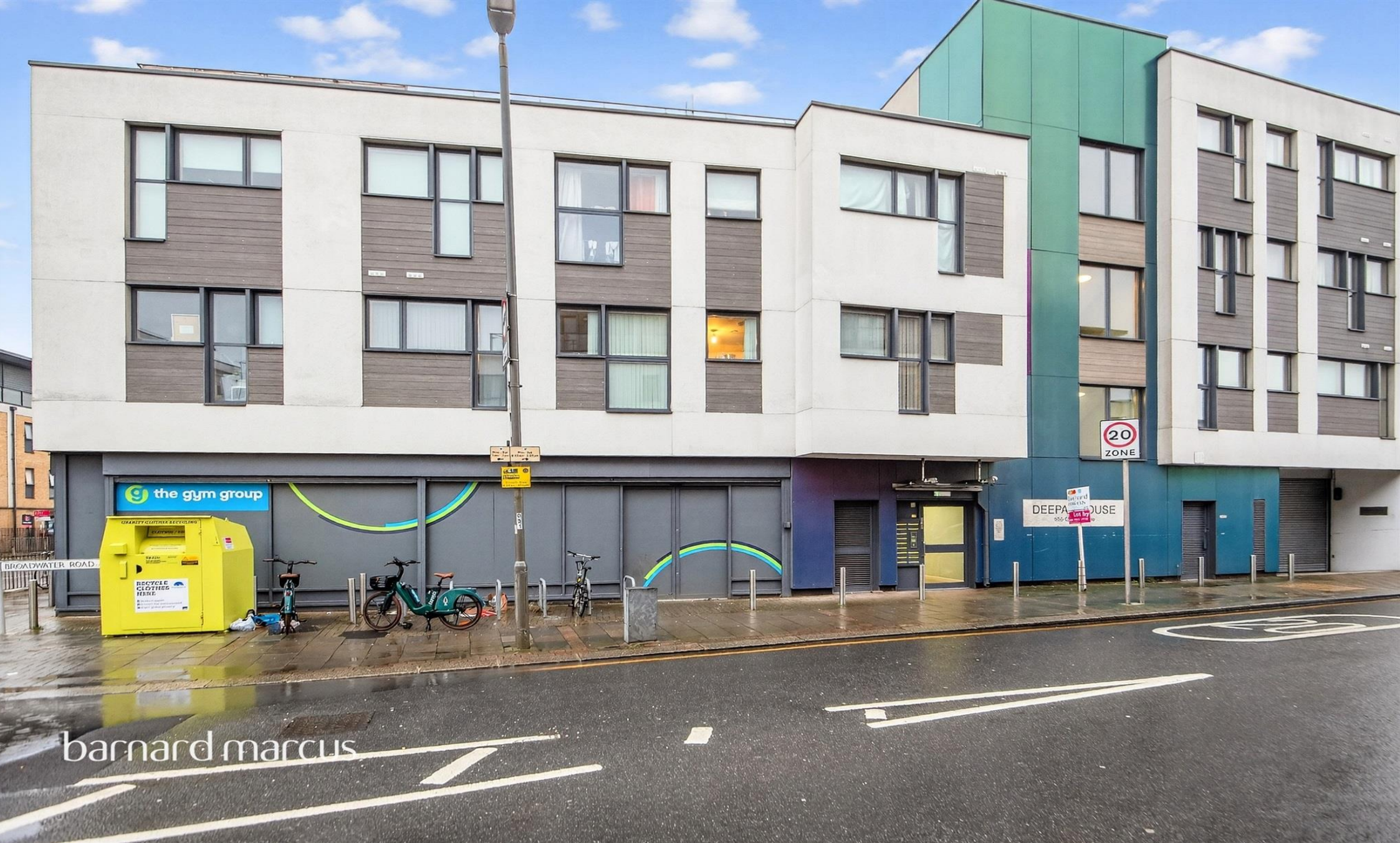
Deepak House Garratt Lane, London SW17 0LR