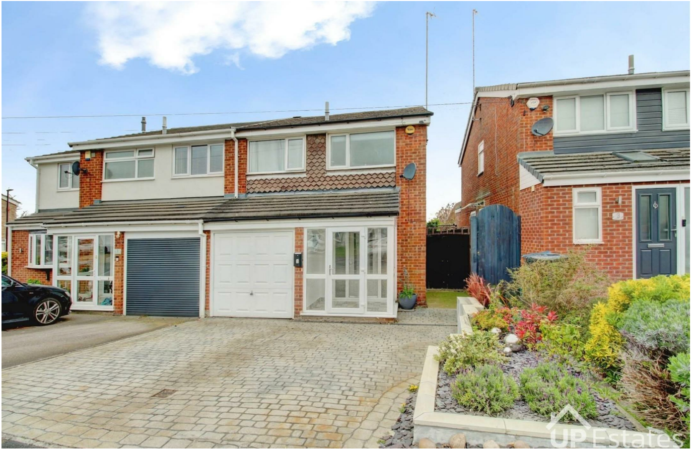
Abbeydale Close, Coventry