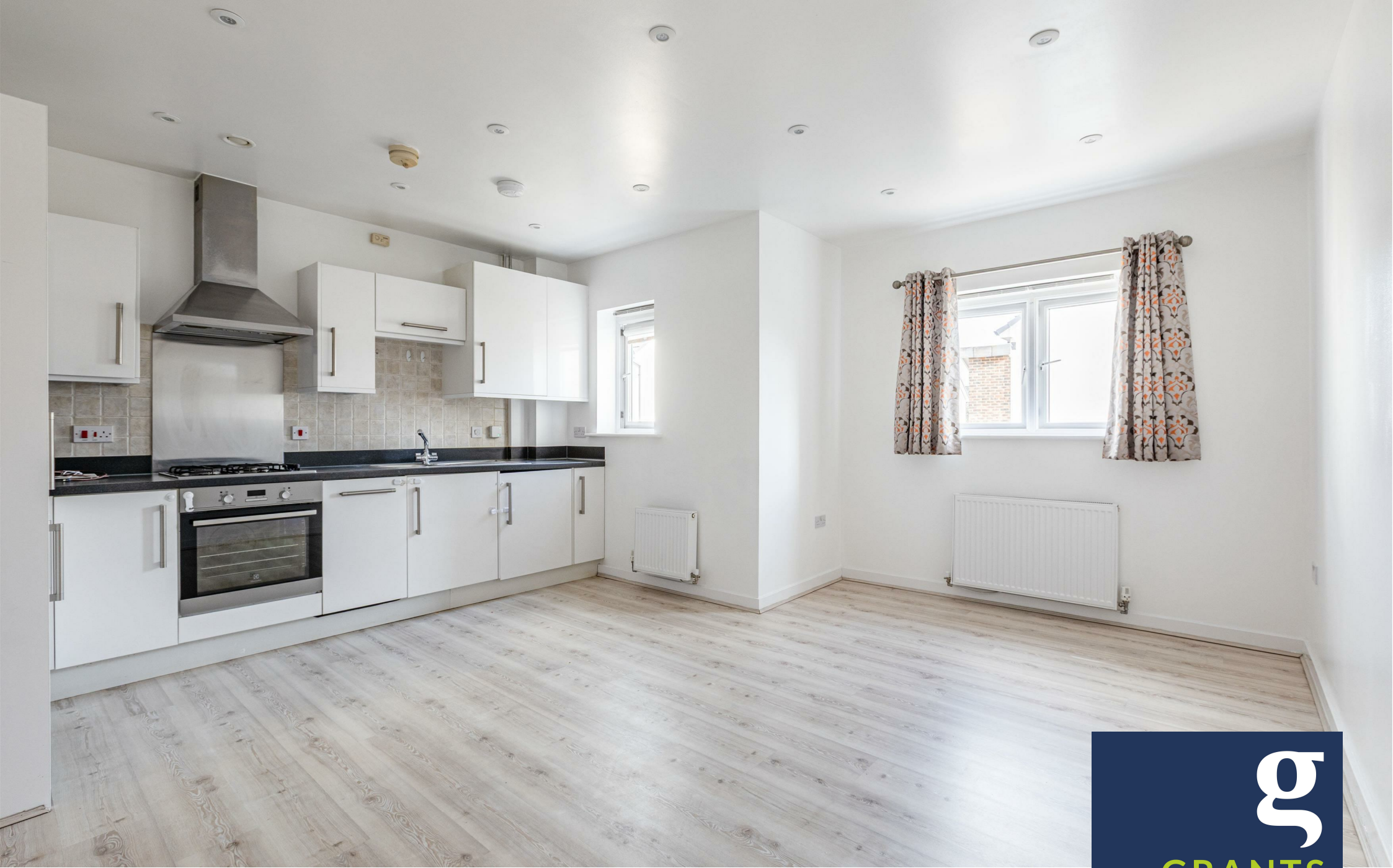
Pyle Close, Addlestone, KT15 2FF