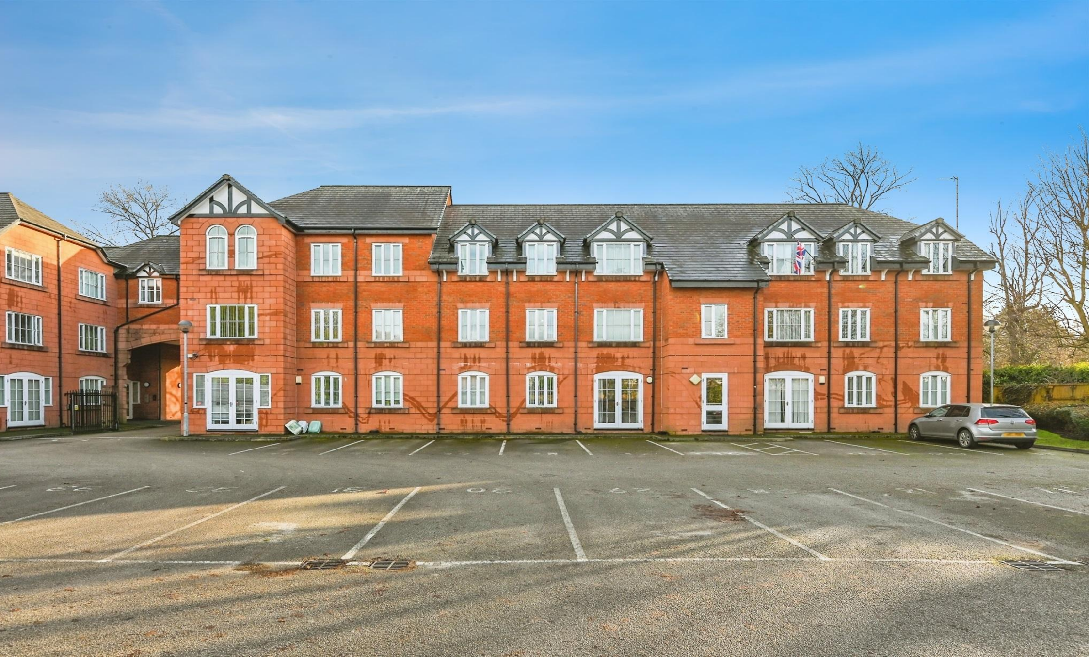
Woodholme Court, Liverpool L25 2BA