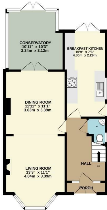
GROUND FLOOR 589 sq.ft. (54.7 sq.m.) approx.