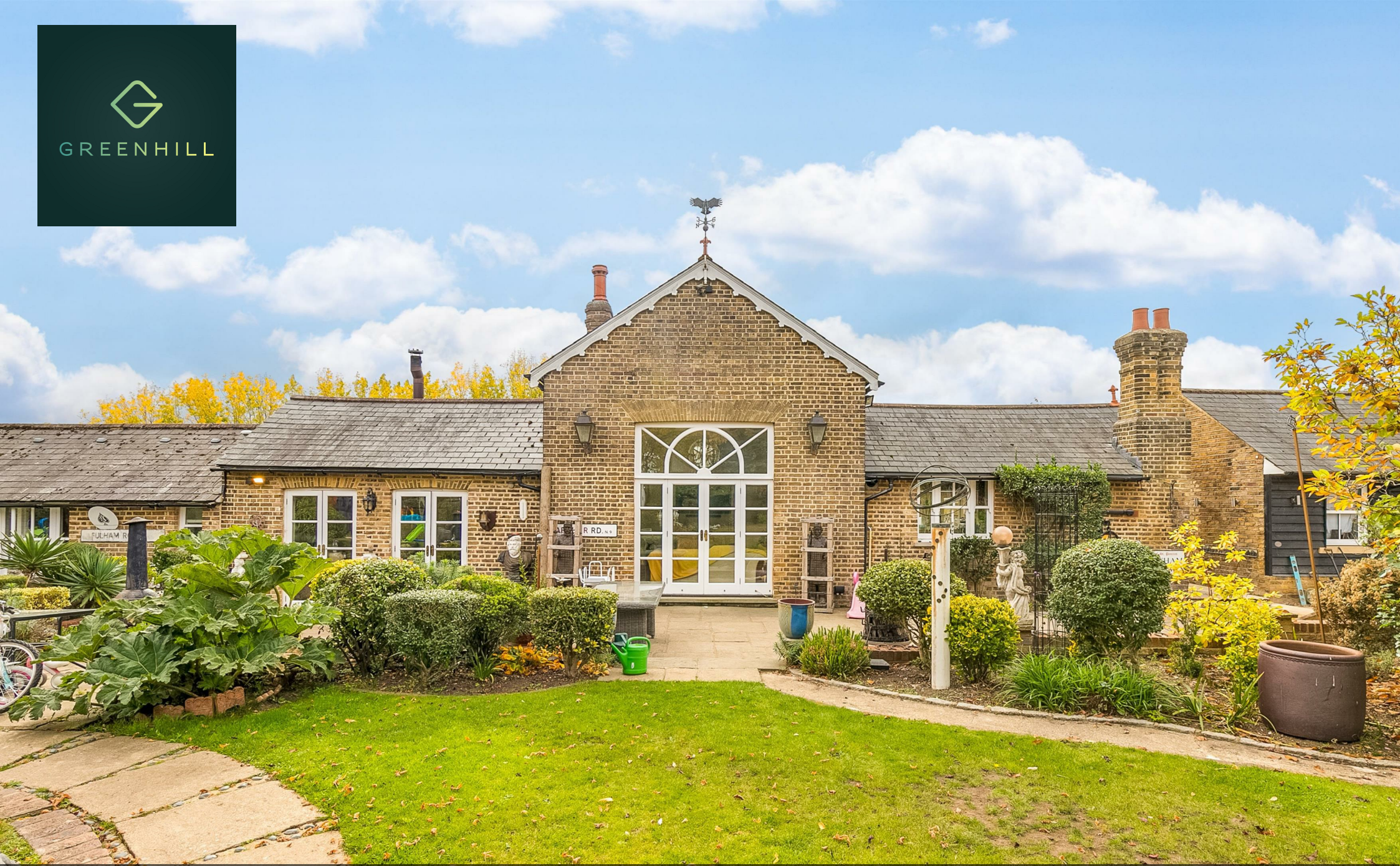
White Stubbs Lane Broxbourne, EN10 7PZ Guide price £1,750,000