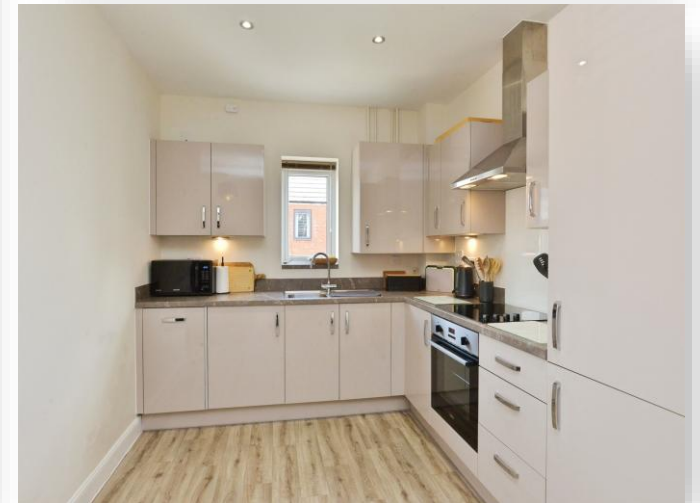
Apollo Avenue, Fairfields Milton Keynes MK11 4DN