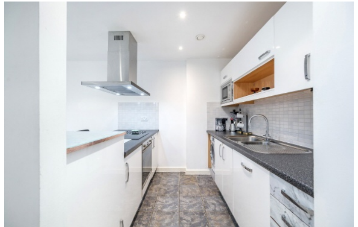
East India Dock Road, E14