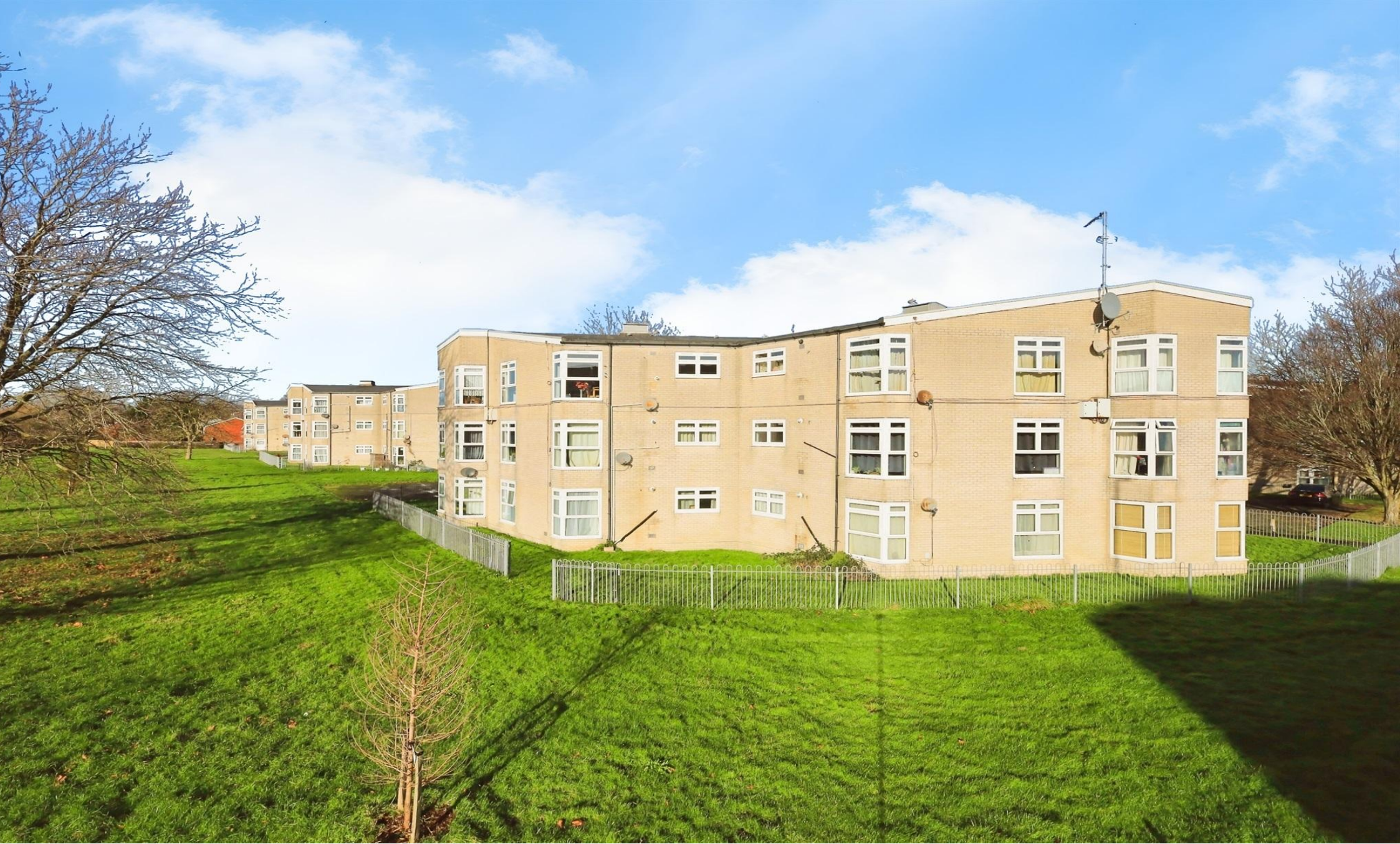
Holly Place, Eastbourne BN22 0UT