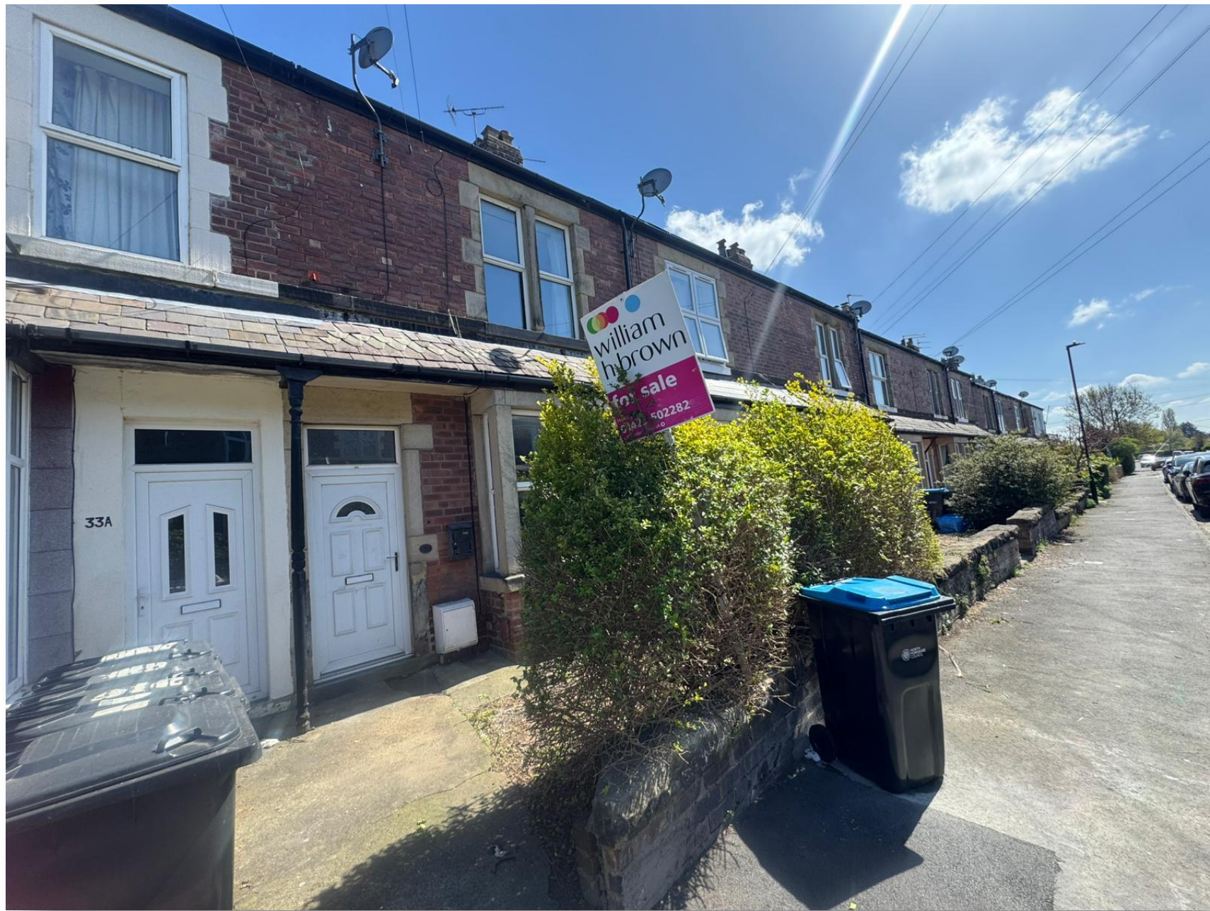
Stonefall Avenue, HarrogateHG2 7NR