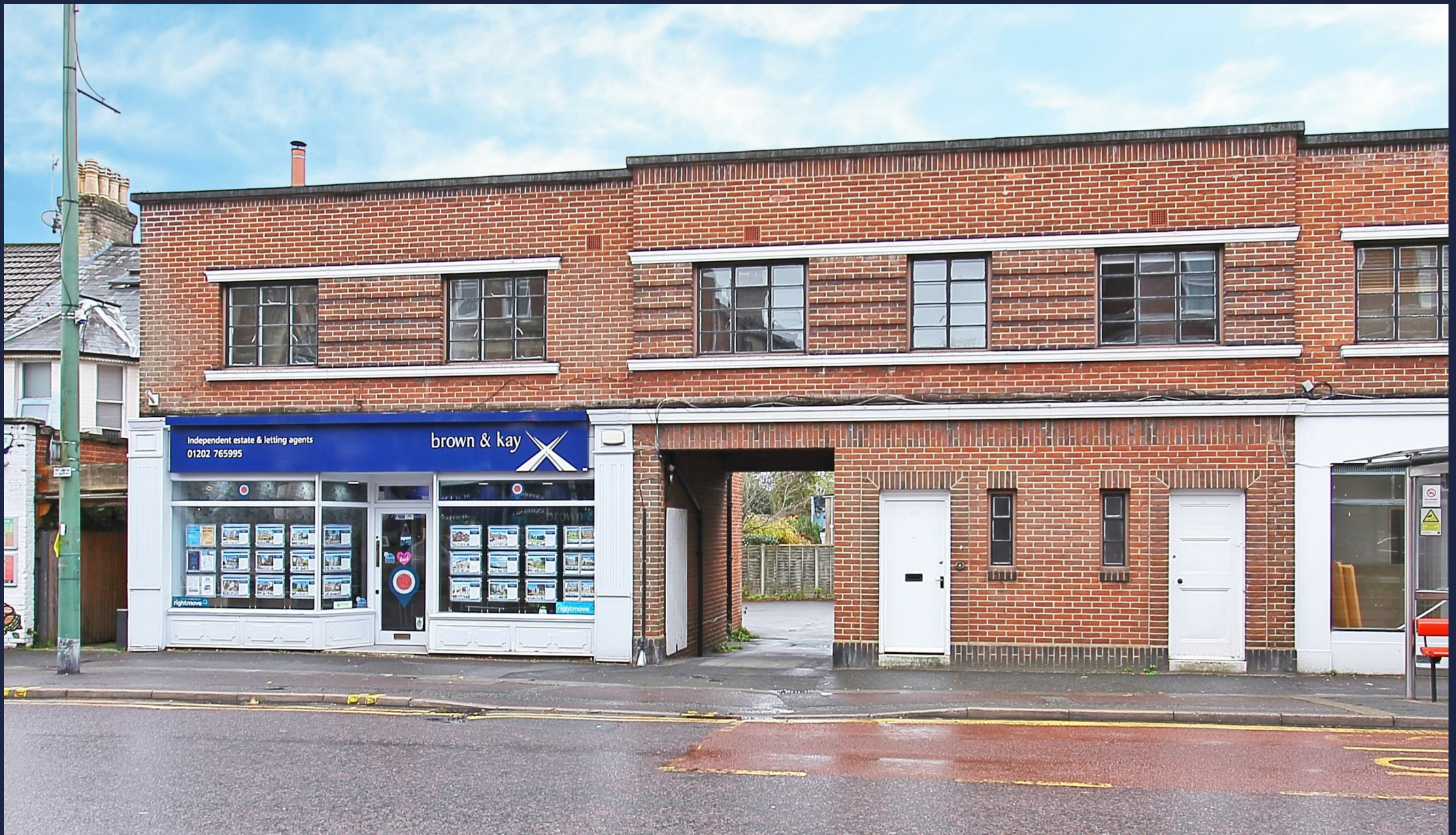
Seamoor Road, Bournemouth