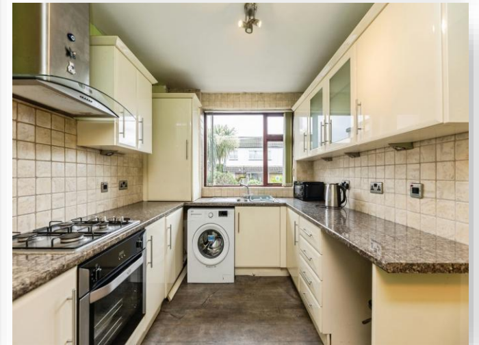
Hembrigg Gardens, Morley Leeds LS27 0ET