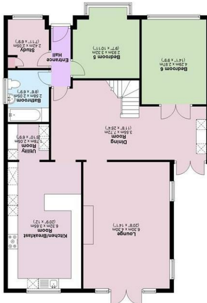
Ground Floor Main area approx. 119 sq metres (1285 sq feet)