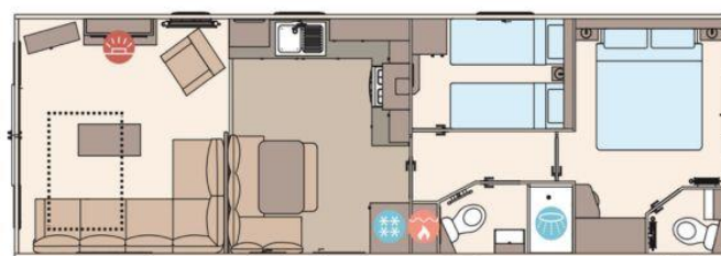
37 x 12 ft, 2 bedroom

Wareham is a Saxon Walled town with its own train station which is on the main Weymouth to London Waterloo Line. The main focal point of the town is its Quay with boat trips to Poole Harbour; with further benefits including Wareham Forest, independent cinema, sports centre, popular schools, restaurants, cafes, St Martins Church & the museum. There is also a market every Saturday.