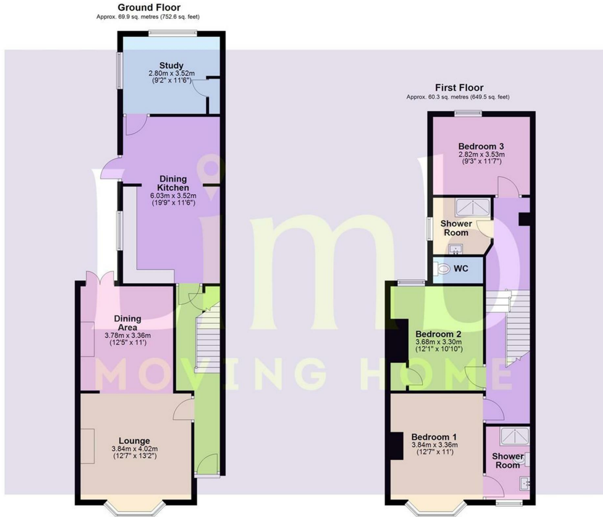
Total area: approx. 130.3 sq. metres (1402.2 sq. feet) 132 Ella Street, Hull