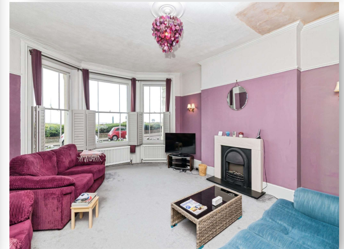
Coventry Guest House Kirkley Cliff, Lowestoft NR33 0BY