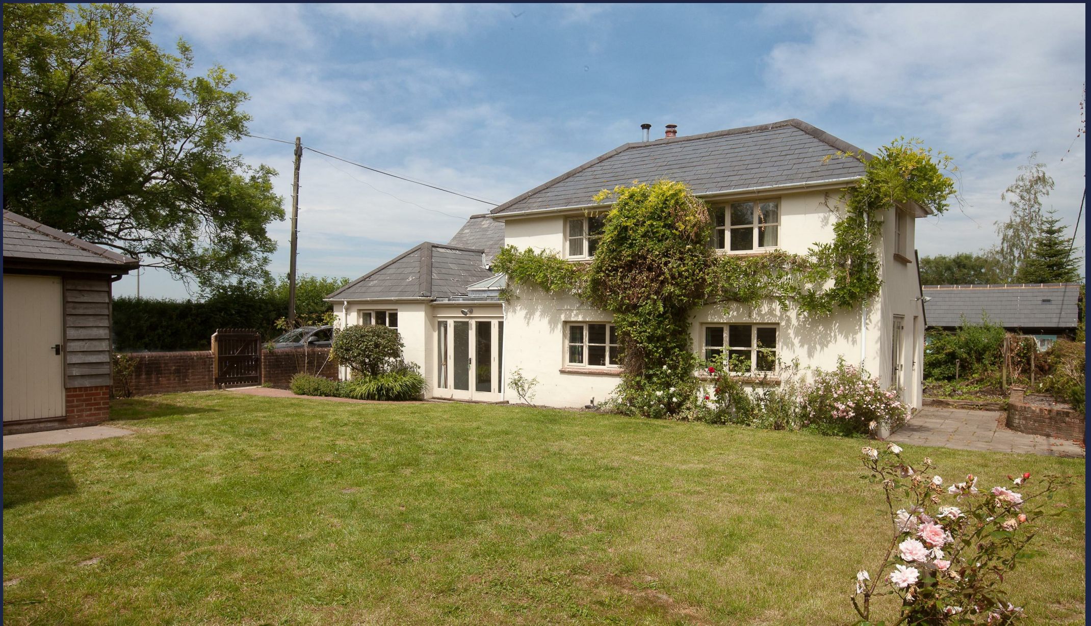
Castle House, Bowerchalke, Salisbury