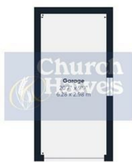
Floor -1 Building 1