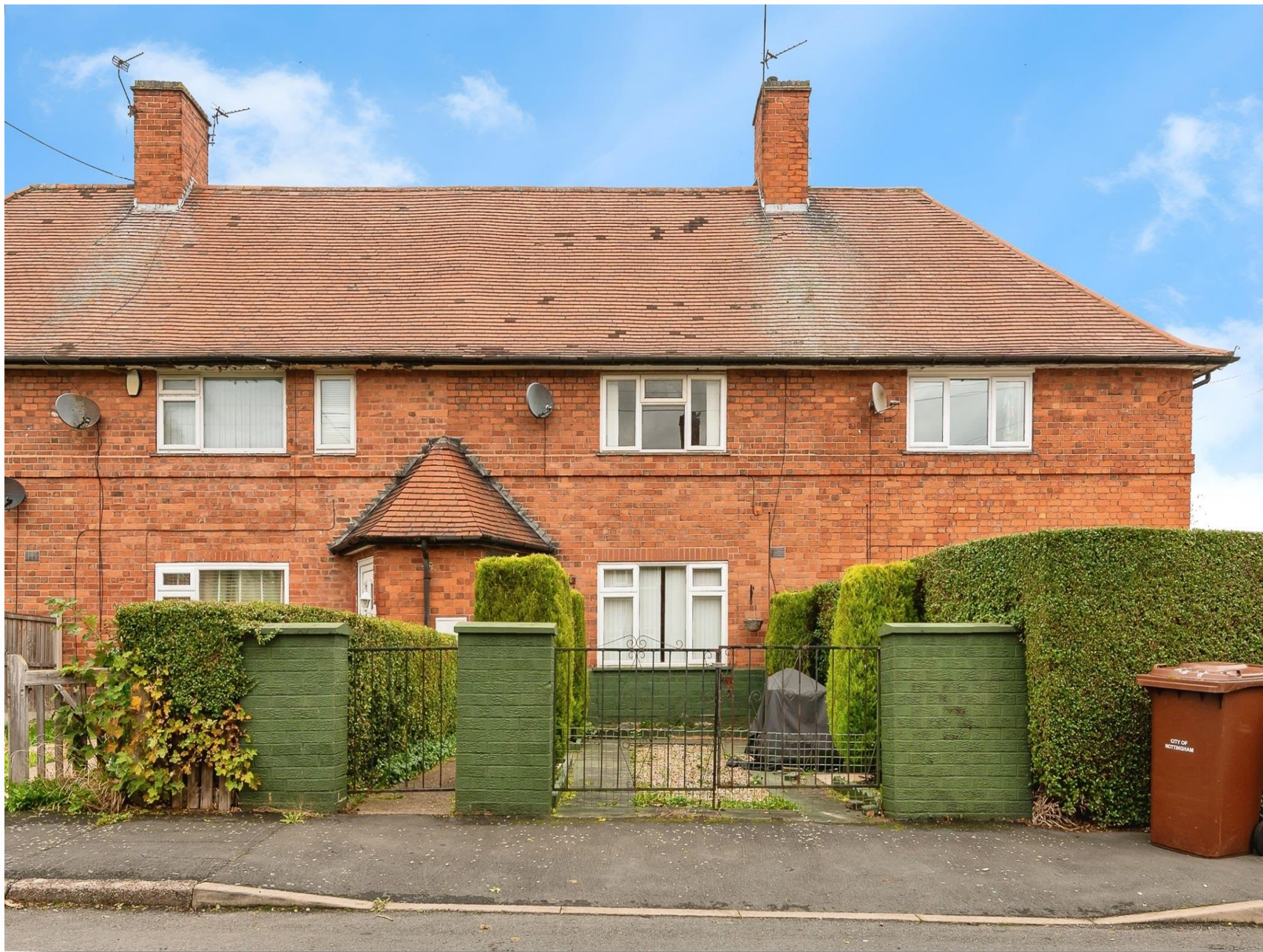
Allendale Avenue, Nottingham NG8 5RD