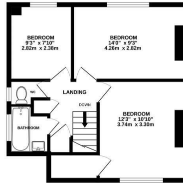
1ST FLOOR 442 sq.ft. (41.0 sq.m.) approx.