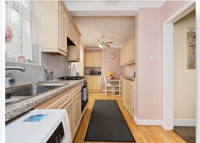
Kathleen Road, Southampton SO19 8LN