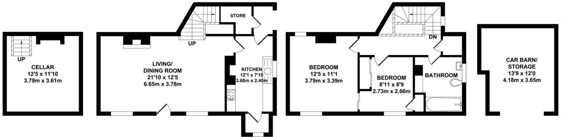
LOWER GROUND FLOOR APPROX. FLOOR AREA 147 SQ.FT. (13.68 SQ.M.)