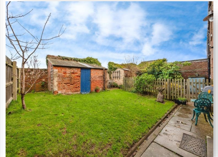
Coast Guard Cottage, Walcott Road, Bacton NR12 0HB