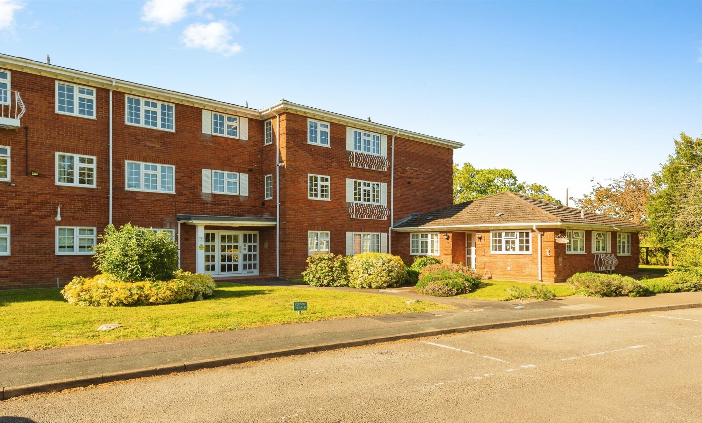
Hillmead Court, Taplow Maidenhead SL6 0QA