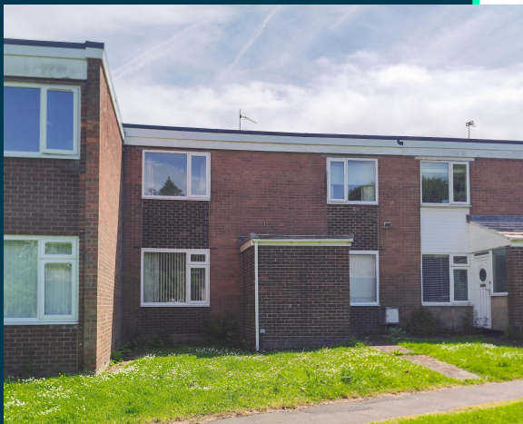
Garesfield Gardens Burnopfield, NE16