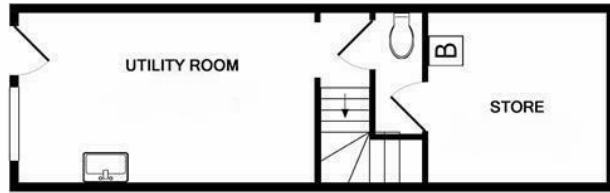
BASEMENT LEVEL APPROX. FLOOR AREA 307 SQ.FT. (28.5 SQ.M.)