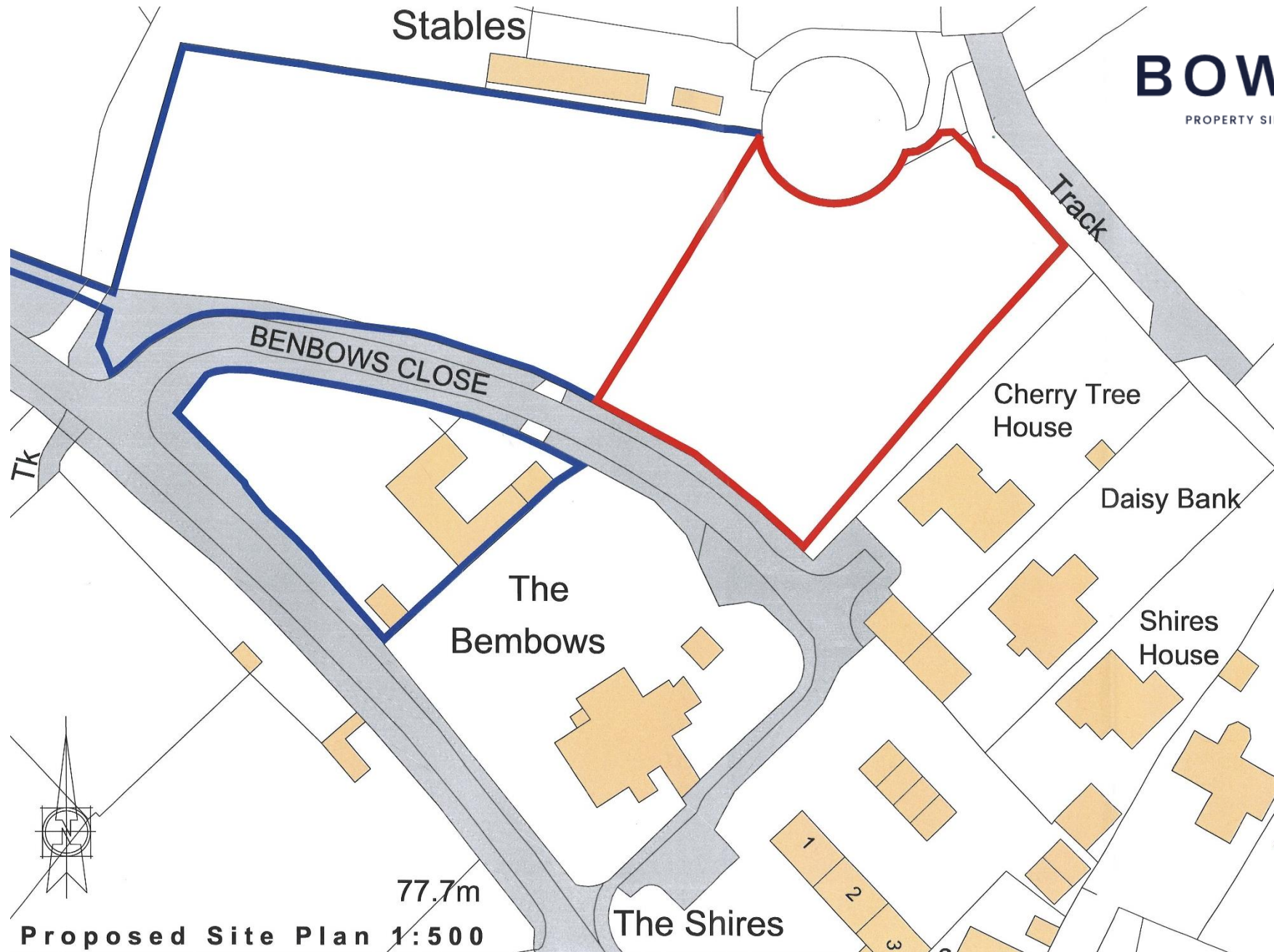
77.7m Proposed Site Plan 1:500