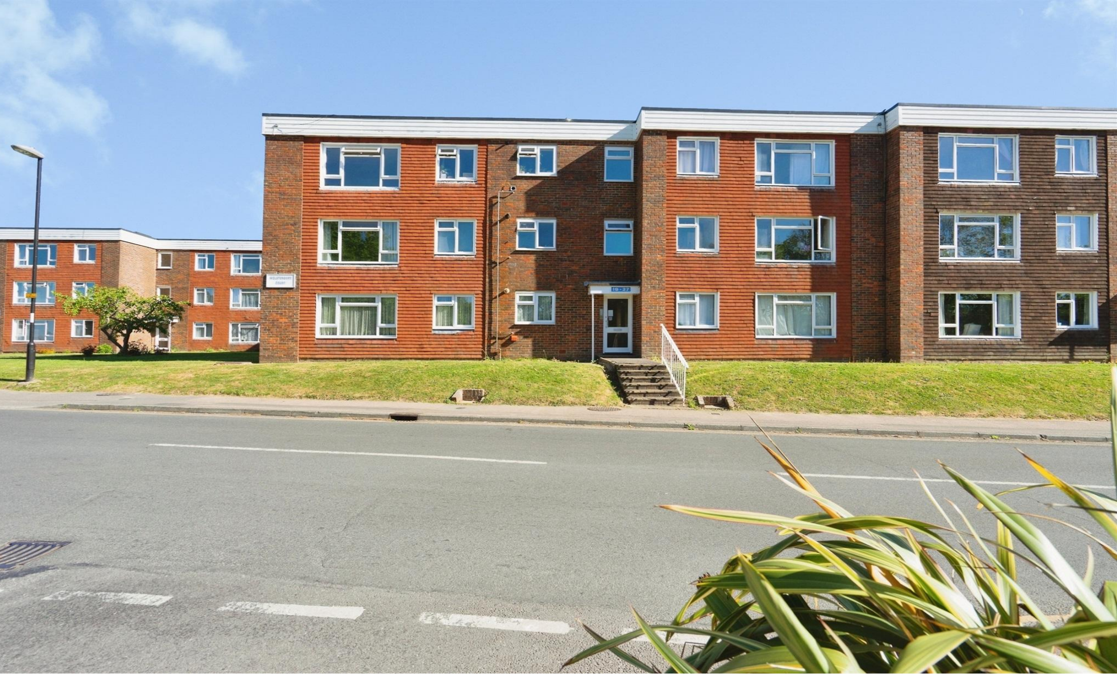
Wolstonbury Court, Burgess Hill, RH15 9DP