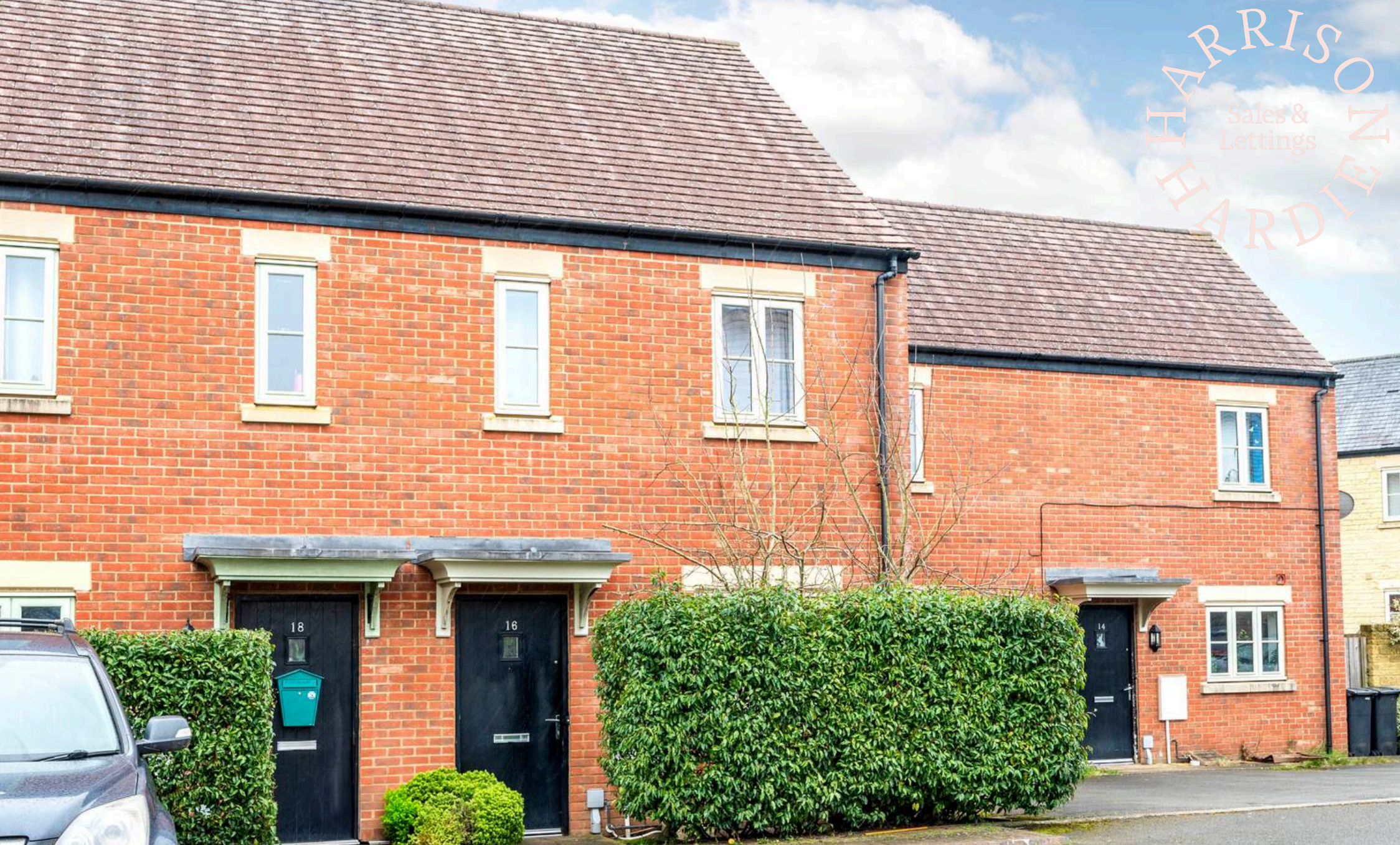
Lysander Way, Moreton-In-Marsh Gloucestershire