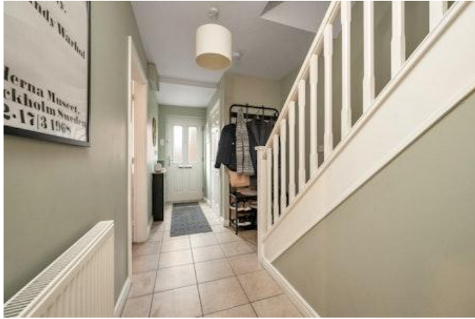
Entrance Hall 5.13m x 2.06m (16'10" x 6'10")