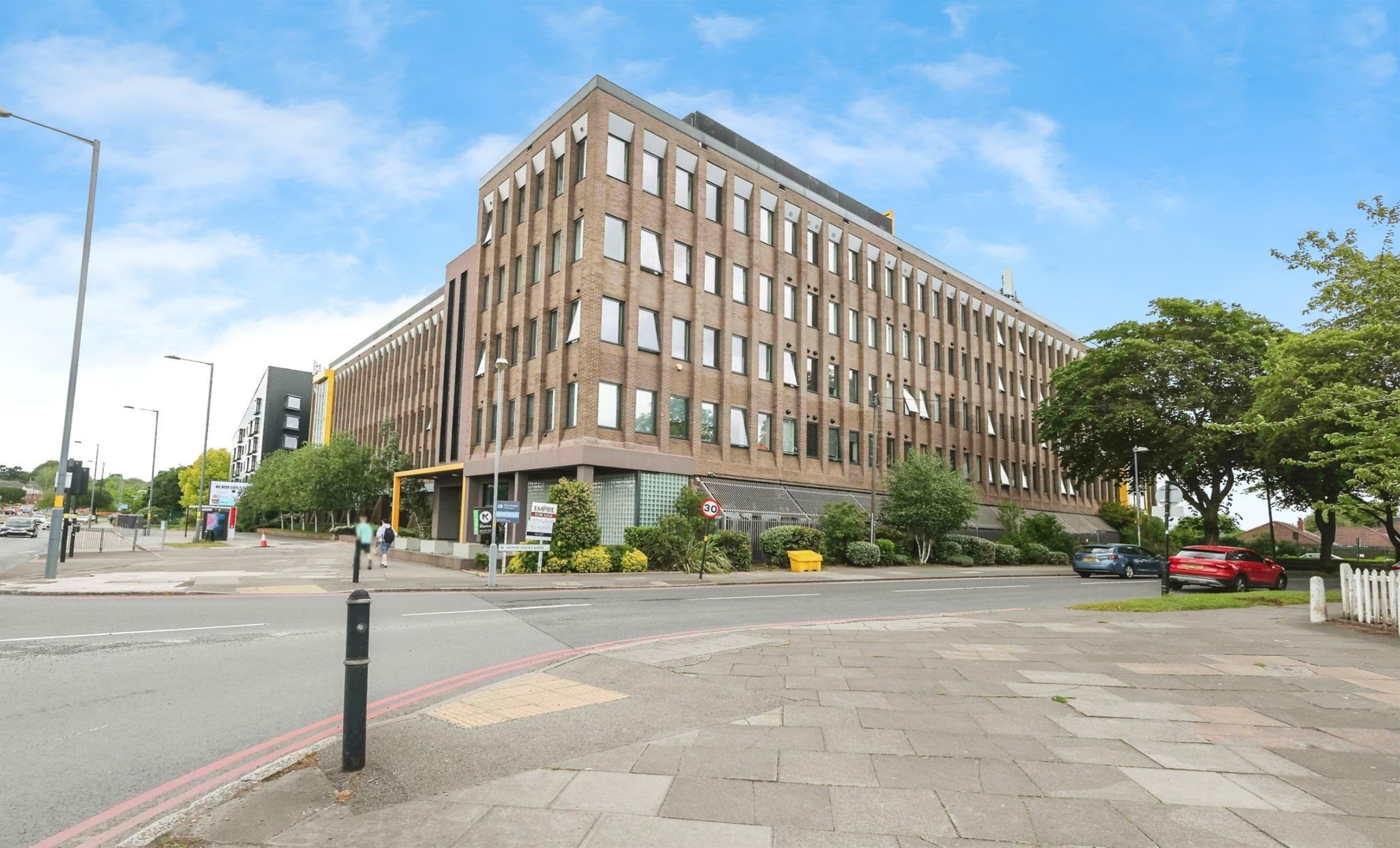
Park Gate At Lyndon Place, Coventry Road, Sheldon, Birmingham