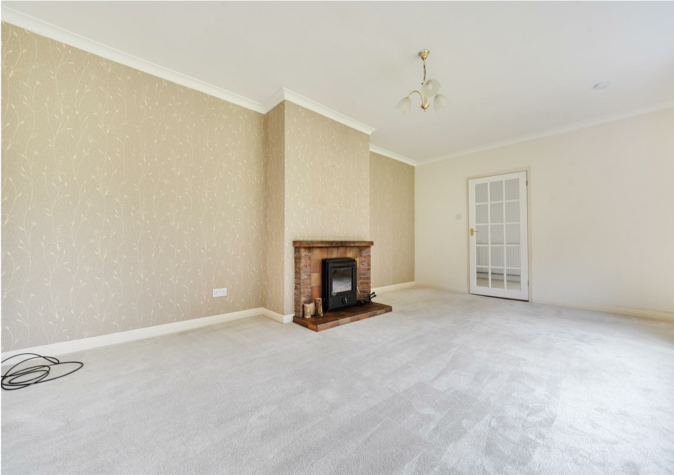
Sunnydene Maryport Road, Maryport