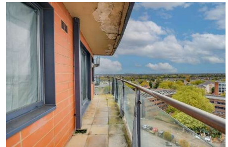
Chelmsford £185,000 1-bed eighth floor apartment