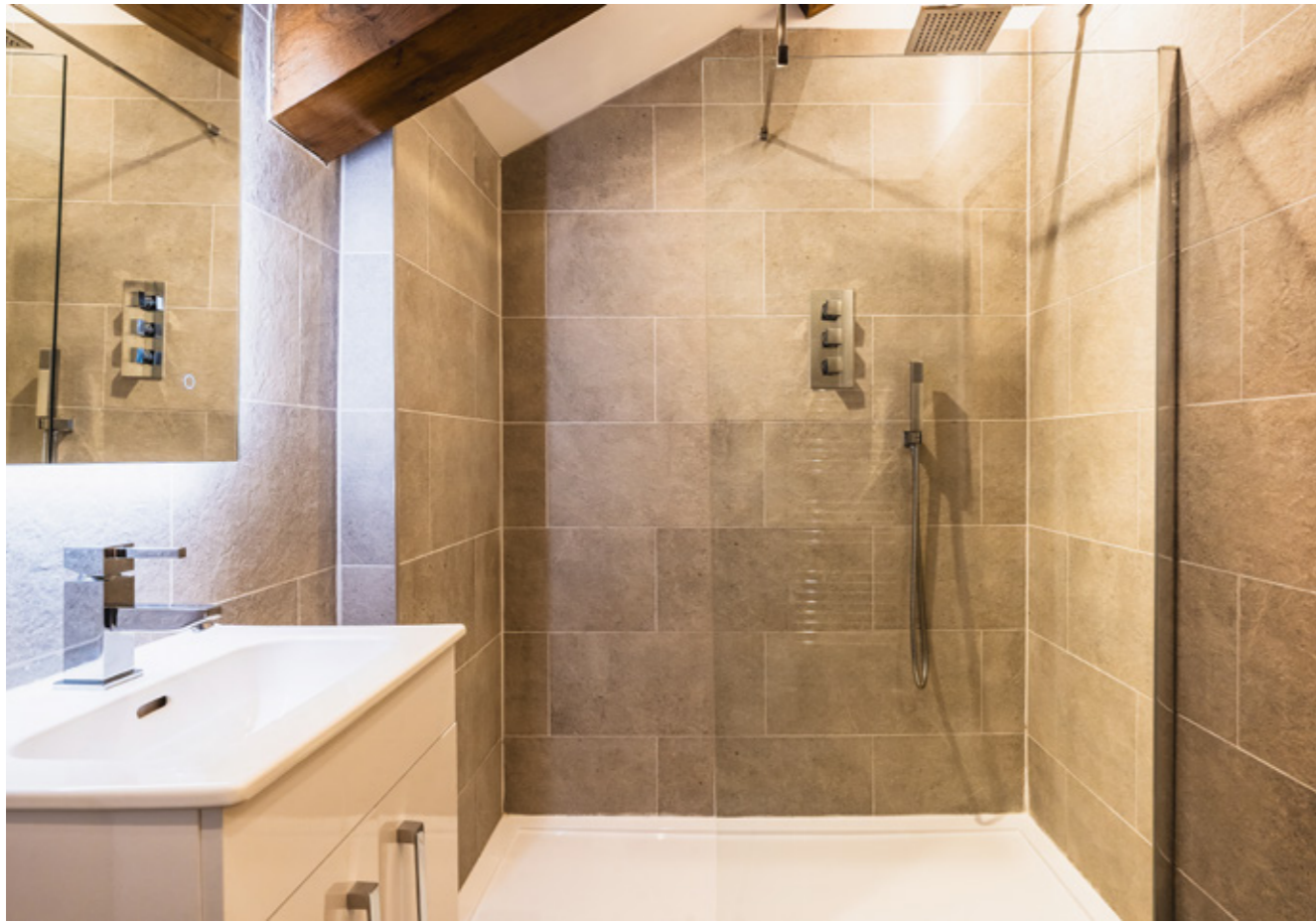
MASTER EN-SUITE SHOWER ROOM