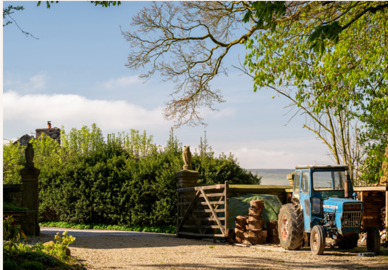
*WOODLAND AVAILABLE BY SEPARATE NEGOTIATION

From the front of the property, a gravelled path leads around to the left side of the property, where there are two log stores. Also from the front garden is an opening that leads to a continuation of the garden with mature trees and a bark chippings path meandering through. Accessible by an opening within a fence is an expanse of woodland with a fire pit that belongs to Chestnut Barn and is available by separate negotiation.