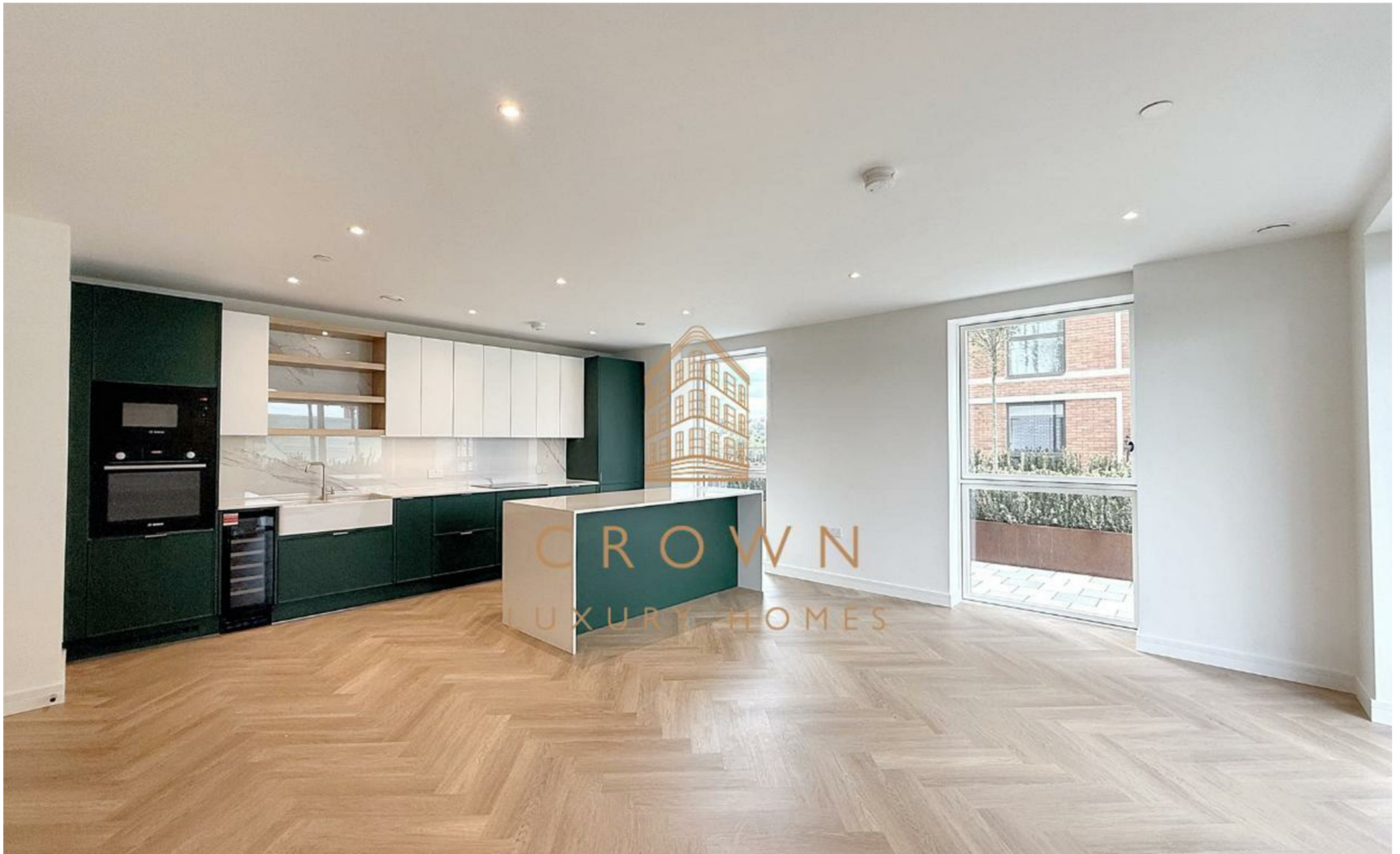
6 Lindley House 1 Henshaw Parade, The Hyde, London, NW9 6GF £660,000