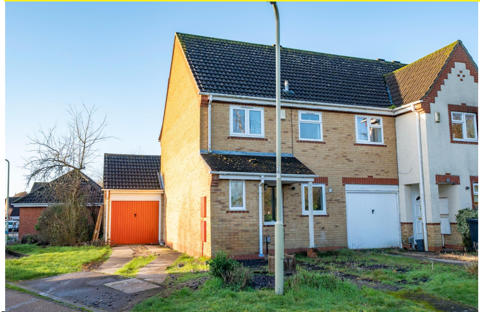
Borkum Close, Andover