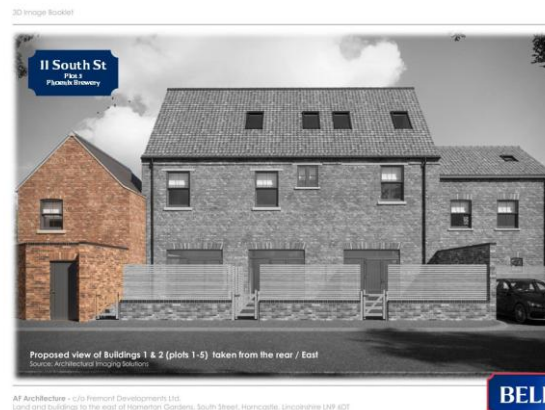
AF Architecture - c/o Fremont Developments Ltd. Land and buildings to the east of Hamerton Gardens, South Street, Horncastle, Lincolnshire LN9 6DT