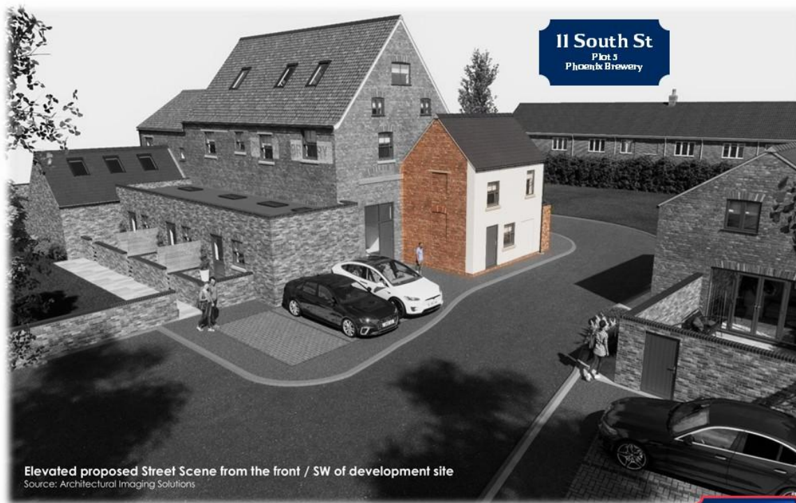
AF Architecture - c/o Fremont Developments Ltd. Land and buildings to the east of Hamerton Gardens, South Street, Horncastle, Lincolnshire LN9 6DT