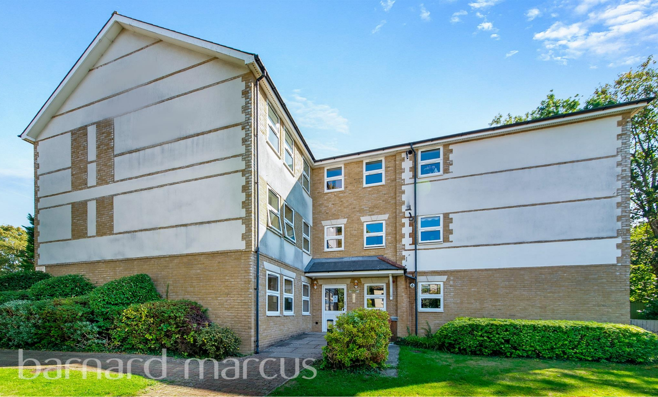
Stoneleigh Court, Birdhurst Rise, South Croydon CR2 7EG