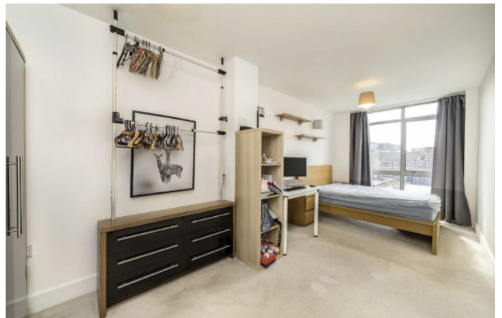
Long Lane, SE1