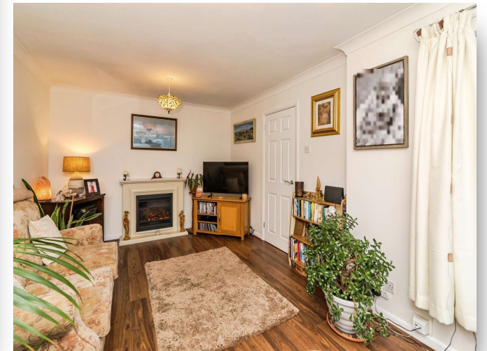
Rock Road, Lowestoft NR32 3NZ