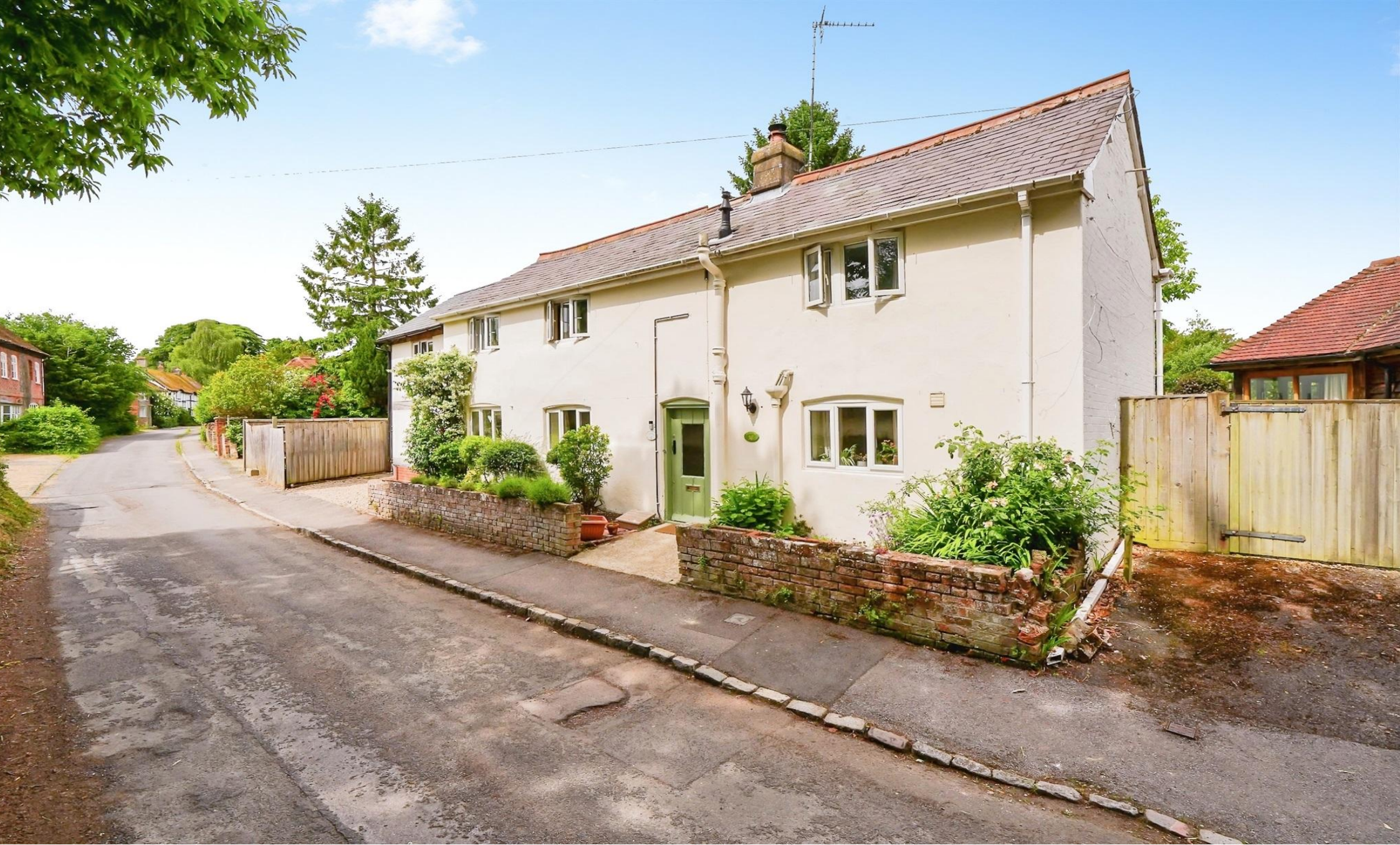
Valentine, Cat Street, East Hendred, Wantage, OX12 8JT