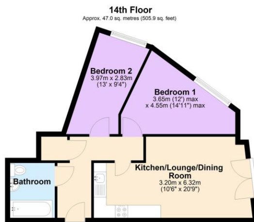
Total area: approx. 47.0 sq. metres (505.9 sq. feet)

Total approx. floor area 506 sq ft (47 sq m)