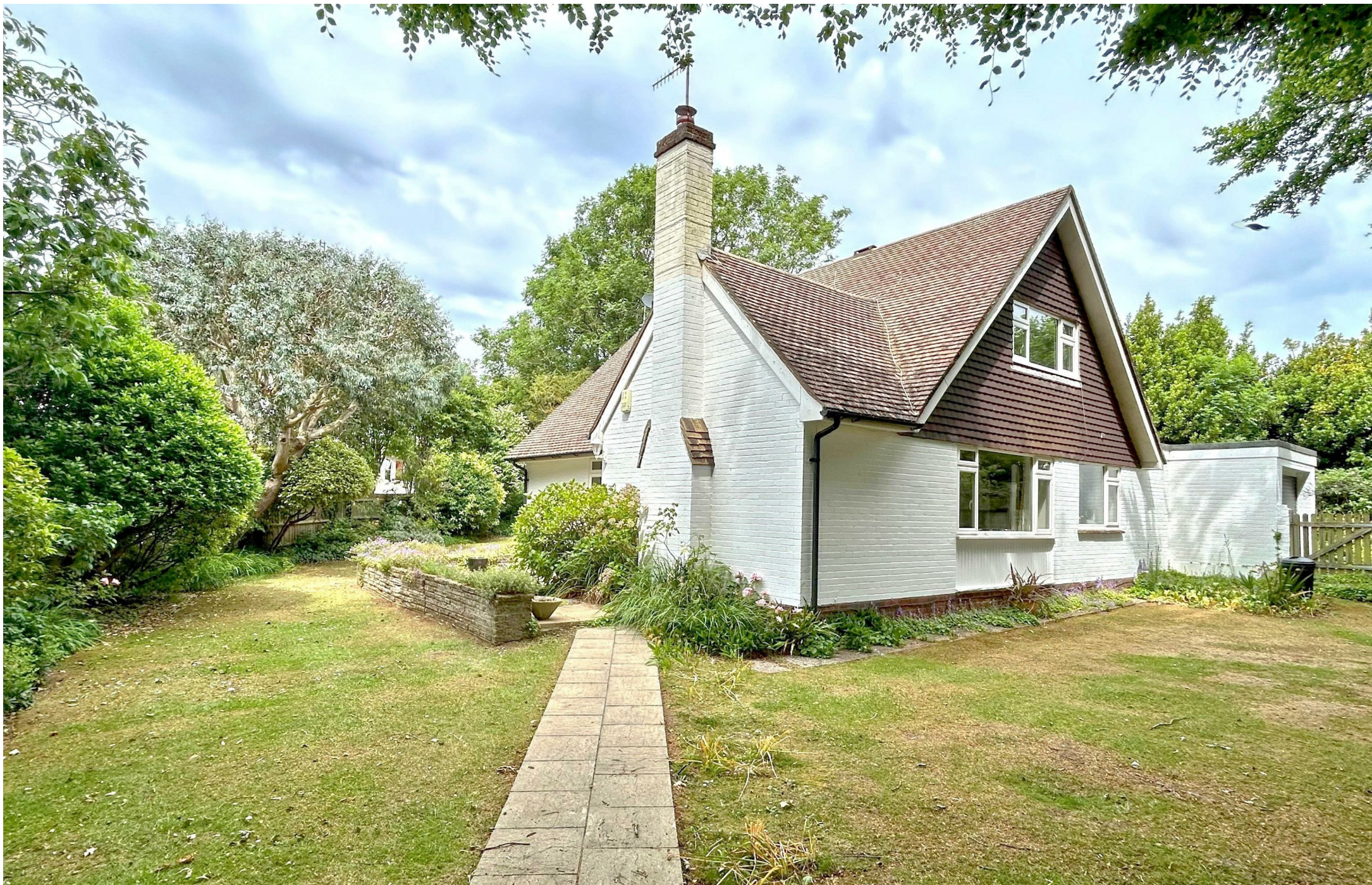
THE SYCAMORES, 9 MANOR ROAD NORTH, SEAFORD, BN25 3RA