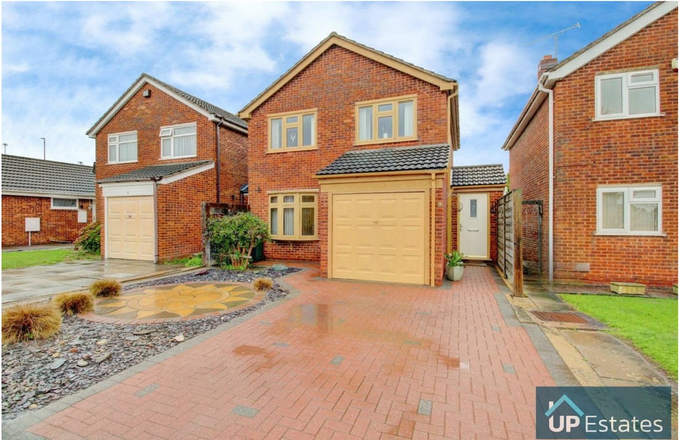
Norman Avenue, Coventry