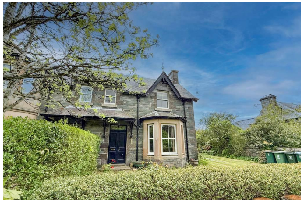
Next Home - Glencona, Taybridge Terrace, Aberfeldy, PH15 2BS