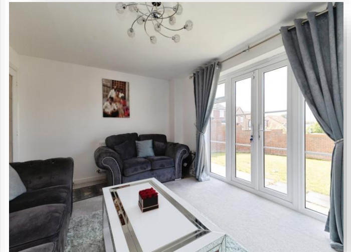
Waterlily Close, Stainton Middlesbrough TS8 9FT